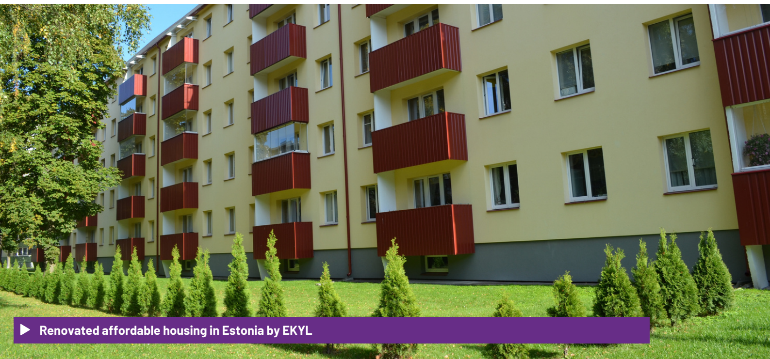
► Renovated affordable housing in Estonia by EKYL