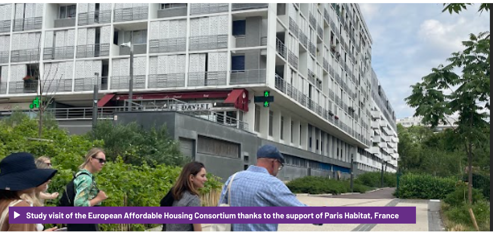
► Study visit of the European Affordable Housing Consortium thanks to the support of Paris Habitat, France