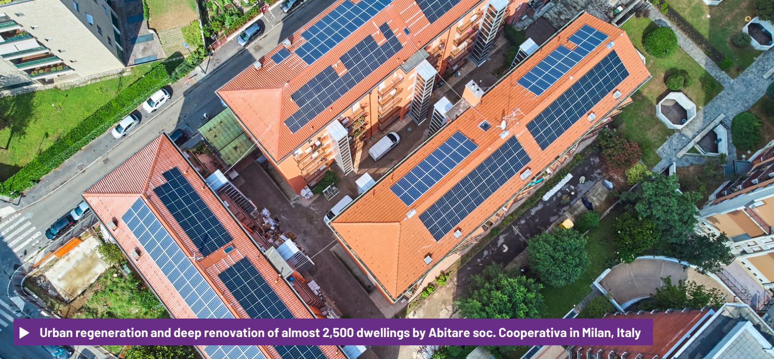
► Urban regeneration and deep renovation of almost 2,500 dwellings by Abitare soc. Cooperativa in Milan, Italy